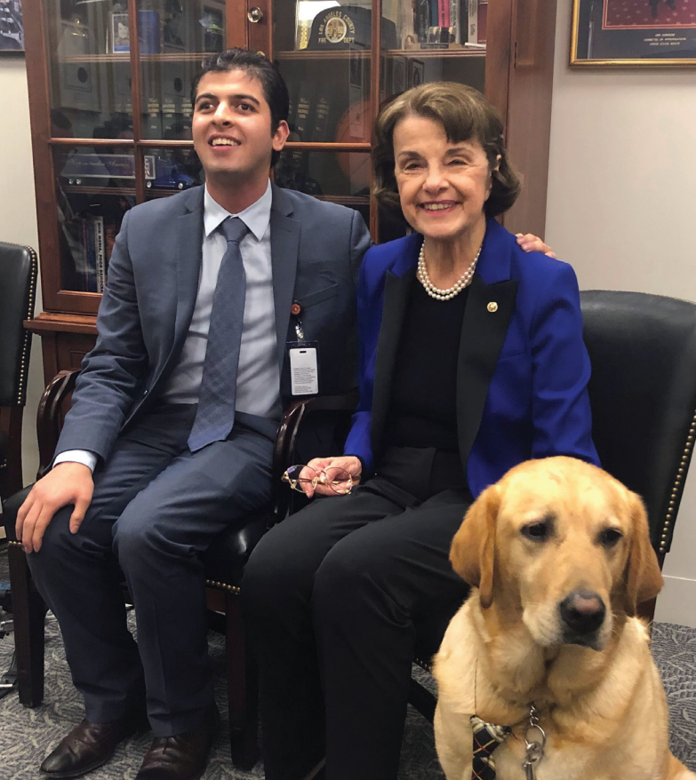
Hilbert and Aero with Senator Feinstein